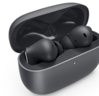
Lenovo TWS Earbuds (X9 Edition)